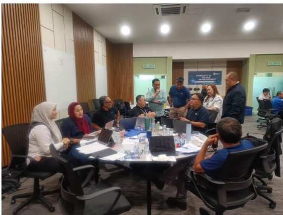
Attendees of the workshop having group discussion

For media enquiries, please contact the Sarawak Metro Corporate Communication team :