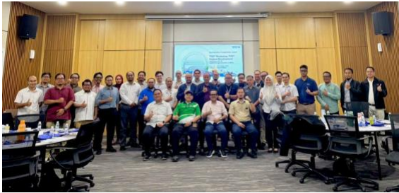
Attendees taking group photo after the opening ceremony of the workshop.