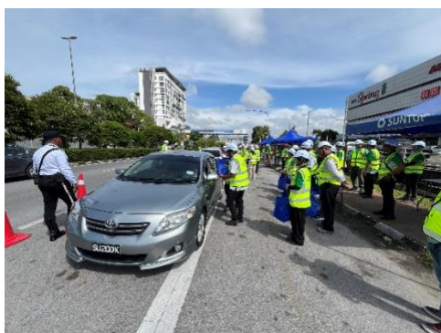
Roads users at Jalan Simpang Tiga receiving goodie bags during the Road Safety Awareness Campaign

For media enquiries, please contact the Sarawak Metro Corporate Communication team :