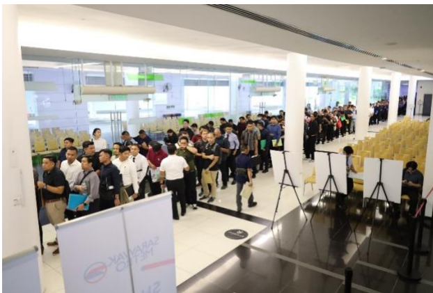
Huge turnout at the interview session