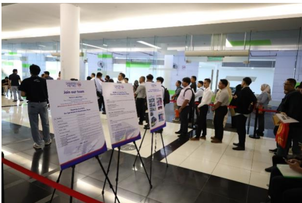
Candidates lining up orderly for their interview session

For media enquiries, please contact the Sarawak Metro Corporate Communication team :