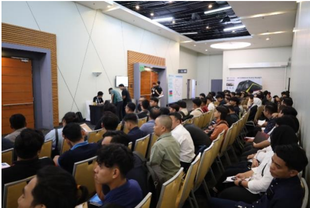
Candidates seated at a waiting area for their interview session