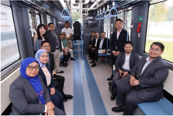
Members of the delegation during the ride on the ART prototype vehicle