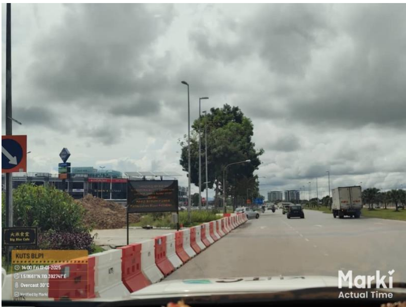
Solar-Powered Variable Message System (PVMS) provides real-time navigation guidance for road users along Blue Line.

For media enquiries, please contact the Sarawak Metro Corporate Communication team :