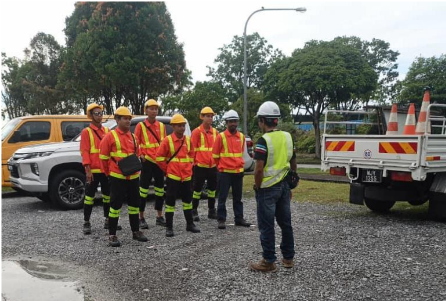
Traffic management team briefed on safety and traffic protocols for smooth operations.