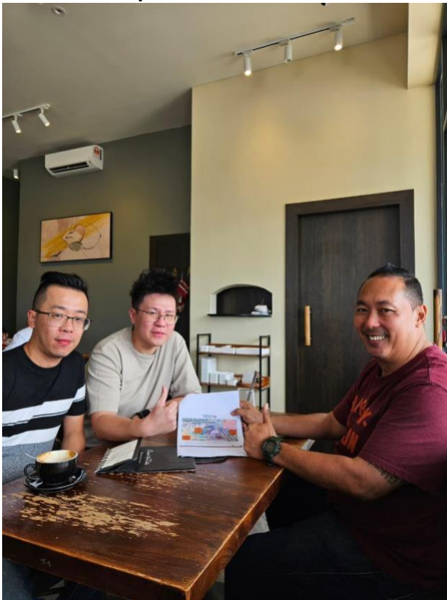
Photo 1: A representative of Sarawak Metro’s Blue Line Package 1 contractor engages with residents in The Northbank area, addressing their concerns and explaining the road closure and construction progress.

For media enquiries, please contact the Sarawak Metro Corporate Communication team :