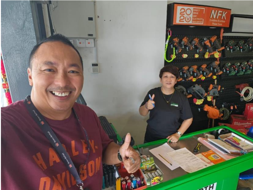
Photo 2: A representative of Sarawak Metro's Blue Line Package 1 contractor (left) informs a business operator in The Northbank area about the recent road closure, ensuring they are updated on the situation and alternative routes.

For media enquiries, please contact the Sarawak Metro Corporate Communication team :