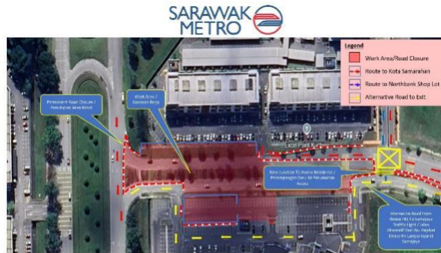
Attachment 2: Layout plan for alternative routes and area affected by the permanent road closure at the left-turn junction to Ibraco HQ and both lanes from Ibraco HQ to 'The Northbank' area. Lampiran 2: Pelan lokasi untuk jalan alternatif dan kawasan terjejas penutupan jalan kekal simpang belok kiri ke Ibu Pejabat Ibraco dan kedua-dua lorong dari Ibu Pejabat Ibraco ke kawasan 'The Northbank'.

Reference Number: KUTTS/5/MS/5-ALL/1/136/7860/TA/000007 Date: 23 December 2024