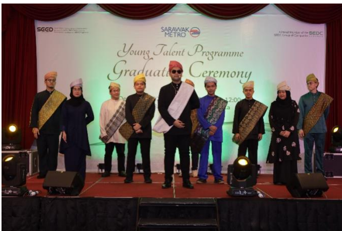
The trainees who are still undergoing their apprenticeship showing their talent by performing the Dikir Barat to kick start the graduation ceremony programme.

For media enquiries, please contact the Sarawak Metro Corporate Communication team :