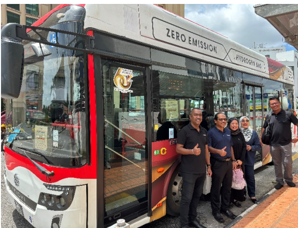
The Rapid Bus team posing with the hydrogen bus.

For media enquiries, please contact the Sarawak Metro Corporate Communication team :