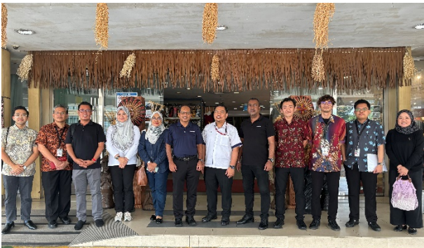
Sarawak Metro and Rapid Bus team, together with officers from Ministry of Transport Sarawak, posing for a group photograph.

For media enquiries, please contact the Sarawak Metro Corporate Communication team :