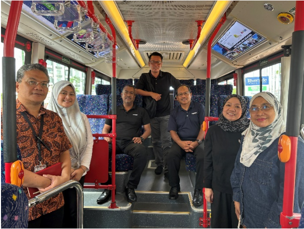
The group enjoying the scenic Downtown Heritage Loop route during the ride in the hydrogen bus.